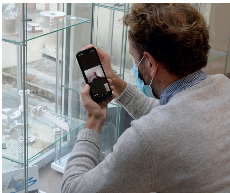
Fig. 2 Live demo