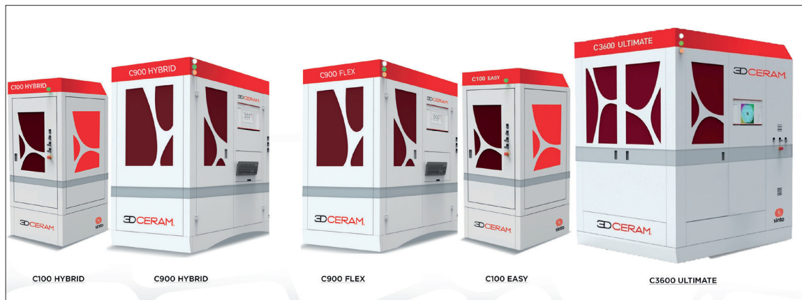
Fig. 3 The printers range of 3DCERAM Sinto

RG: We support our industrial customers from the beginning to the delivery of the 3D-printing production line and even after. For industrial people, we study their ROI needs, a key indicator in production tool investments. We showcase the machine printing parts in our facility. Remember what I told you before: now we are able to do live demo even with customers living in countries far away from Limoges! We provide on-line process support for users from beginner to confirmed level. This includes CAD file creation, design of 3D-print support, a manufacturing troubleshooting guide, as well as preparation of the building platform and sintering process. But once the machine is delivered, our partnership is far from being over. The aftersales, training and process audit allows the clients to develop their skills further and then reach the intended ROI.