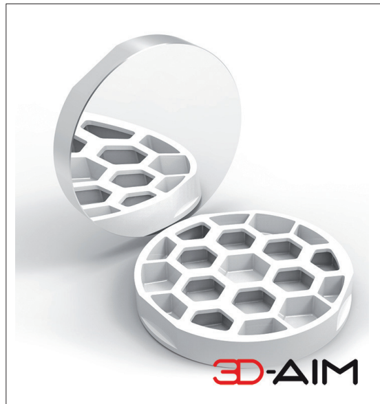
Fig. 5 Satellite mirror produced using AM

We have also created a hybrid process capable of embedding other materials into ceramic parts. The technology in question is not being brought to market as a new machine. Instead, 3DCERAM has developed an update for its exist-