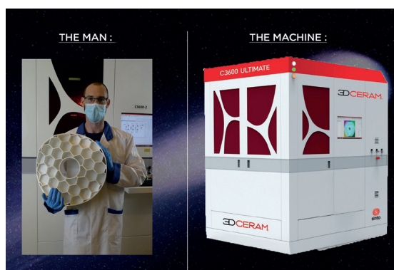
Fig. 4 Printing with industrial printer C3600

As the different user segments have specific needs, it is key to partner with key players in certain markets. This is why, we have started new collaborations with technology partners in 2020. One example is AVIGNON CERAMIC, which specializes in the design and manufacture of ceramic cores and offers high end CIM solutions for production of casting parts to the investment casting industry. The partnership is willing to give the answer to the expectations of the actors of the investment casting, founders and manufacturers of nuclei, of an interlocutor able to propose a turnkey solution.